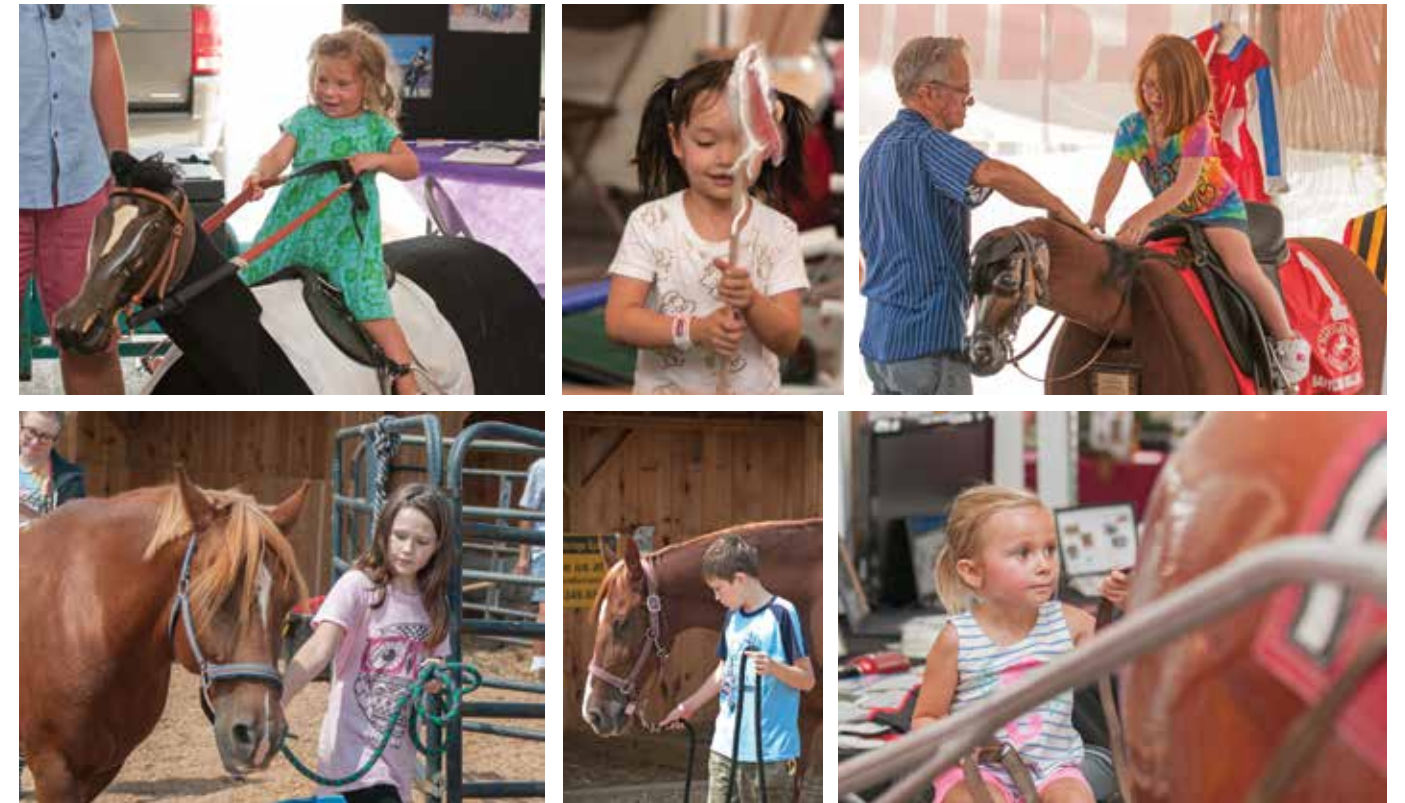
The Maryland Horse industry once again teamed up to host Horseland, which featured 11 days of free equine demonstrations and activities, at the fair. Highlights included plenty of smiling young faces taking part.