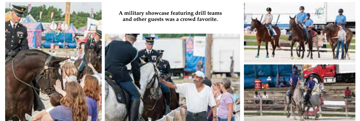
A military showcase featuring drill teams and other guests was a crowd favorite.