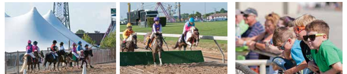
Pony races were again part of the fair, with action on the dirt track at Timonium.