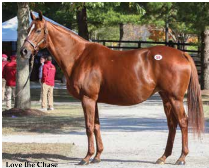
Love the Chase

Love the Chase, the dam of all-time North American earner and multiple champion California Chrome, was the first mare to bring seven figures at the sale when John McCormack Bloodstock signed the ticket for $1.95 million. Carrying her fifth foal, to the cover of leading sire Tapit, the 10-year-old daughter of leading Maryland sire Not For Love was consigned by Taylor Made Sales Agency. Bred by Bowman and Higgins Stable, the chestnut mare is out of