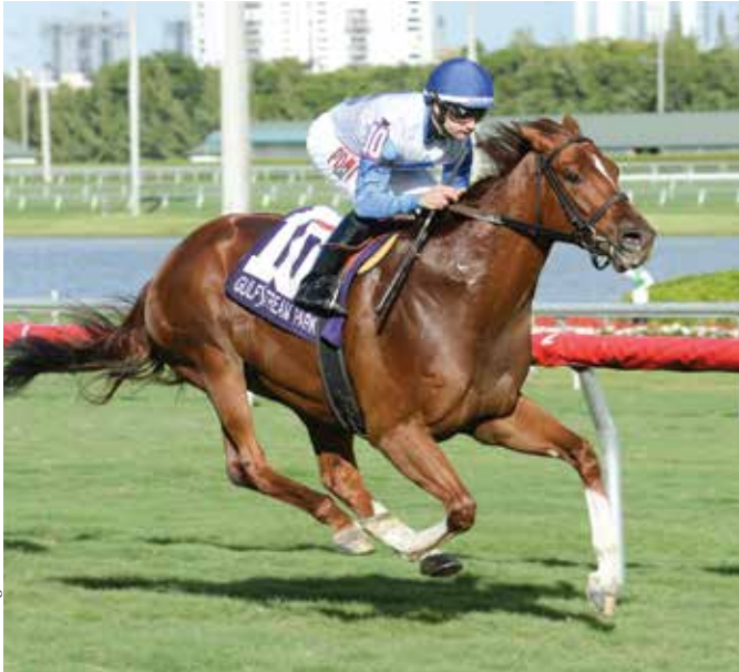
4 Lauren King