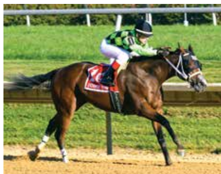
Enchanted Star led a Maryland-bred sweep in Small Wonder for 2-year-old fillies.