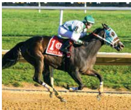
Hailey's Flip got her fifth win, but first in stakes, in the Tax Free Shopping Distaff.