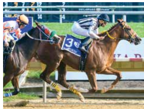
Whereshetoldmetogo holds off Jamaican Don to win the First State Dash.