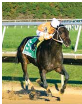
Winplaceorshowono takes the New Castle.