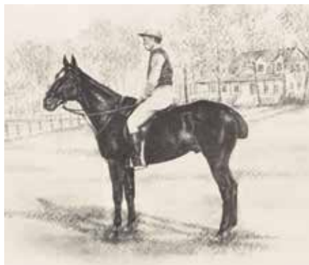
Garry Owen's triple (1901, 1902, 1907) was interrupted by Princeton.