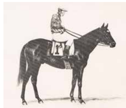
Mountain Dew (1962, 1965, 1967) was first or second in six of his eight Hunt Cup starts.

Since Cancottage, five horses have won the Hunt Cup twice.