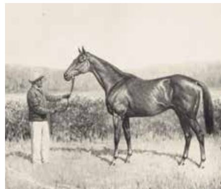
Blockade (1938-40) is the only horse to win in three consecutive years.

Since it's the last, everything comes together nicely."