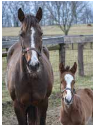
Model Figure , by Distant View , with her daughter by Into Mischief at Shamrock Farm .