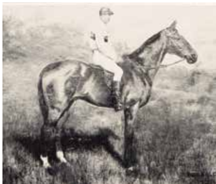
Princeton (1903, 1905, 1906) was the first to win three Hunt Cups.