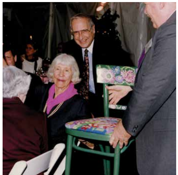
Hoofprints, Inc. (2)