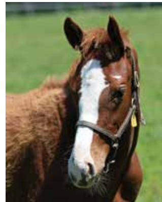
The first foal out of stakes-winning, graded stakes-placed Vielsalm is a Munnings foal.