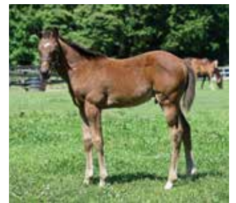
Multiple stakes winner Not Abroad is the sire of a colt out of stakes performer Phyxius.