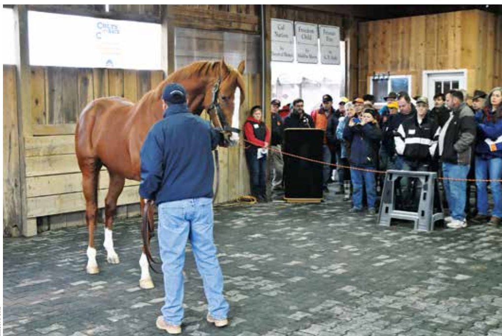
New stallion Freedom Child (left) entertained the crowd at Country Life Farm at its February open house. The event marked the return of stallions to Country Life in Bel Air after a two-year stint at Merryland Farm.