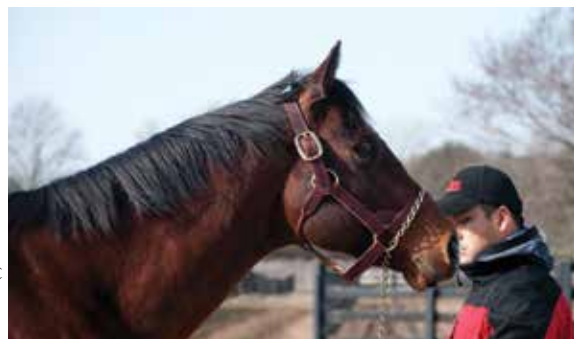
Northview Stallion Station's January open house showcased (below, left to right): newcomer Buffum, Dance With Ravens and the state's stallion dean Not For Love.