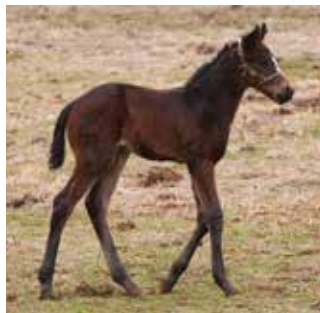
Dominus filly foaled at Country Life Farm is out of Danzing Celtic (by Danzig).