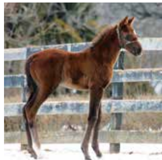
Cal Nation filly out of Skip Away Belle was bred by Country Life Farm.