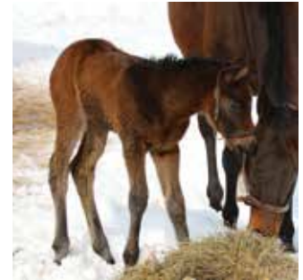
Stakes winner Tamberino is dam of Archarcharch filly bred by Spendthrift Farm and foaled at Country Life.