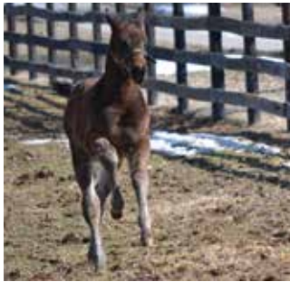
Outflanker—Saucy Countess colt is a half-brother to 2014 stakes winner Lotsa Mischief.