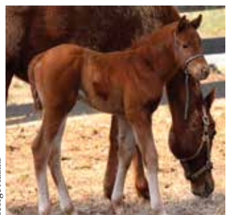
Filly by Cal Nation out of Jersey Pearl, by Oratory.