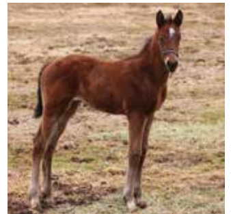
Friesan Fire—Helen Louise filly is a granddaughter of graded winner Silent Turn.