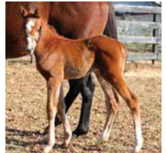
Cal Nation filly is first foal out of WinStar Farm's stakes-winning mare Noble Maz.