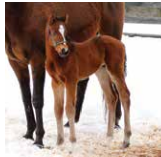
Old Fashioned—Susquehanna River colt is a full brother to undefeated The Trunk Monkey.