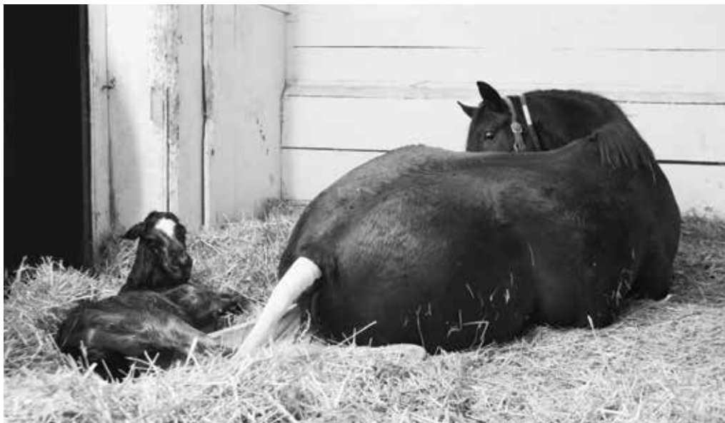
Ellen B. Pons

4 "M apping" is a method of visualizing ideas.