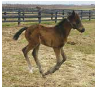
Dance With Ravens filly is Show Your Shoes' first foal.