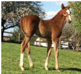
Gandhi—Spaghetti Western filly bred by Sterling Farm.