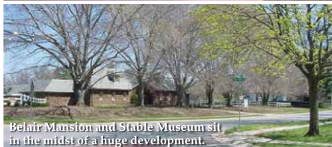
Belair Mansion and Stable Museum sit in the midst of a huge development.