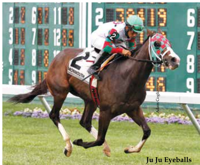
Ju Ju Eyeballs