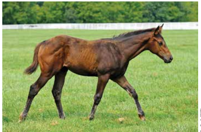
Marathon Farms' Uncle Mo—Lucette colt is a half-brother to graded winner Everyday Heroes from family of Ghostzapper.