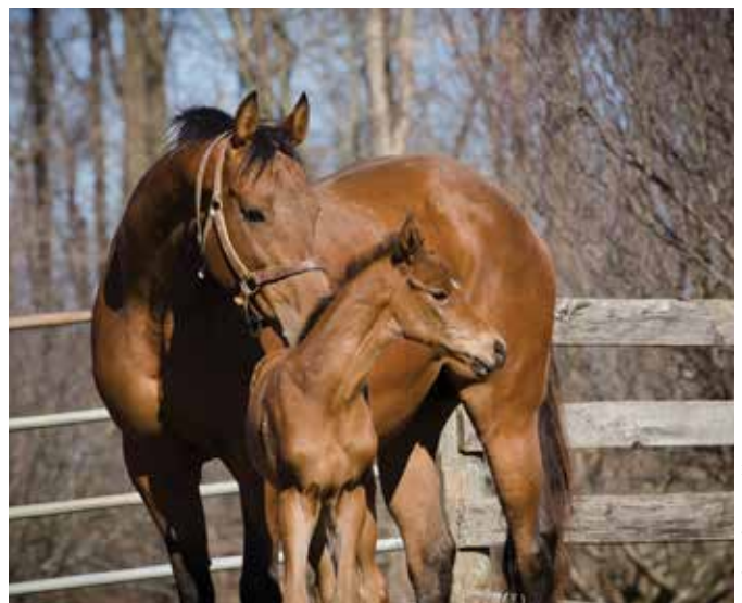
Nicole Ausherman (2)