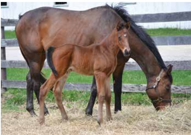
Nicanor's first crop includes colt out of Timothy Rooney's Smart Strike mare Smart Policy foaled at Shamrock Farm.