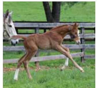
Violence colt out of stakes winner Littlebitabbling strikes a pose.