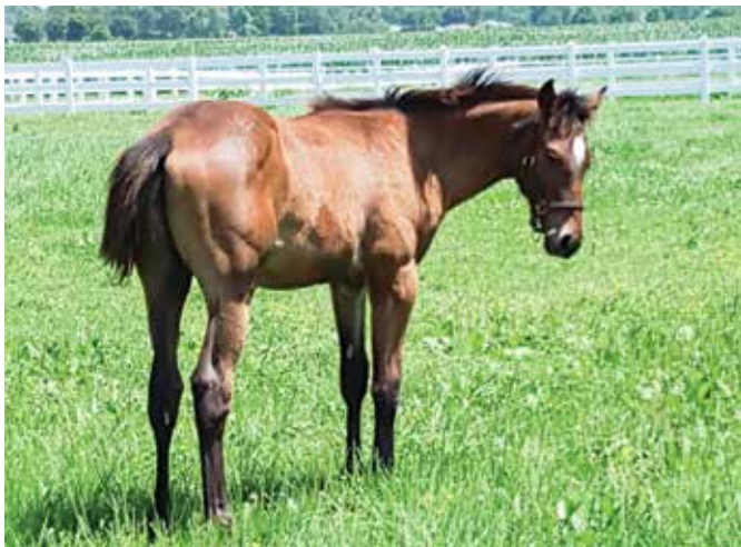
Concord Point colt bred by Fellowship Farm is the first foal out of $116,838-earner Our Louie's Lass (by Honour and Glory).