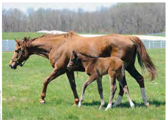
Marathon Farms' Bodemeister colt with his dam, the winning A.P. Indy mare Lady Lindy.

TOPAZIO, by More Than Ready, ch.f., April 6, by Afleet Alex. Thornmar. Mare to First Samurai.