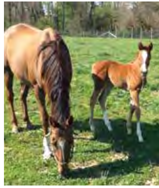
Stakes-placed Topazio (by More Than Ready) produced an Afleet Alex filly for Thornmar.