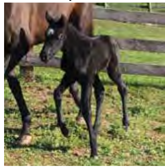
Filly by Despite the Odds is out of Shanfield (by Shaniko), bred by La Bella Vita Farm.