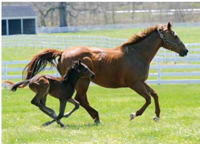
Maryland-bred champion Willa On the Move shows off her colt by Take Charge Indy at Marathon Farms.