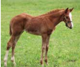
Angelika Hala (2)