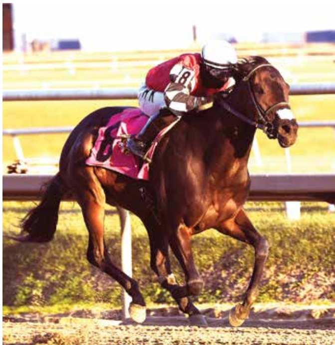
Lovable Lady, racing in the colors of the Samuel H. Rogers Jr. Trust, recorded her second Maryland Fund stakes win in a row in the Politely, after taking the Jameela in August in her stakes debut.

Bonuses paid for races at Maryland tracks October 1 to October 31, 2016