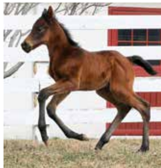
Maryland-bred champion Walkwithapurpose has a daughter of Uncle Mo, foaled at Sagamore Farm Feb. 14.