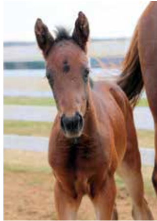
Sagamore Farm's Hard Spun filly out of La Milanese is a half-sister to multiple stakes-placed Ginger N Rye.