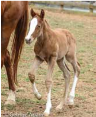
Graydar filly out of Stormy Atlantic mare Atlantic Rainbow, bred by Housatonic Stables.