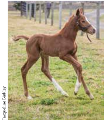
Maple Valley Farm is the breeder of the Buffum colt out of Mojo's Pristina.