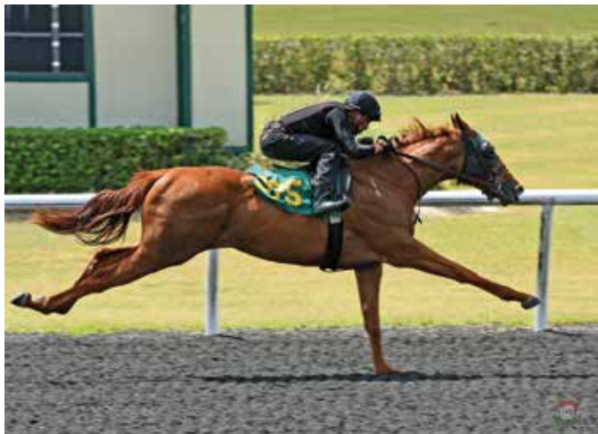
Friesan Fire filly out of the Duck the Punch (by Two Punch) turned in an eye-catching work at the Ocala Training Sale.

Following the trend from the March select sale, Maryland-breds sold well above the sale's average at the April Ocala Breeders' Sales Company's