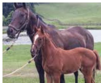
Delaware Beach Bloodstock's Our Bernadette (by Bernstein) and her El Padrino colt, foaled May 1, reside at Bonita Farm.