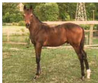
A son of Friesan Fire out of Pure Strike strikes a pose.