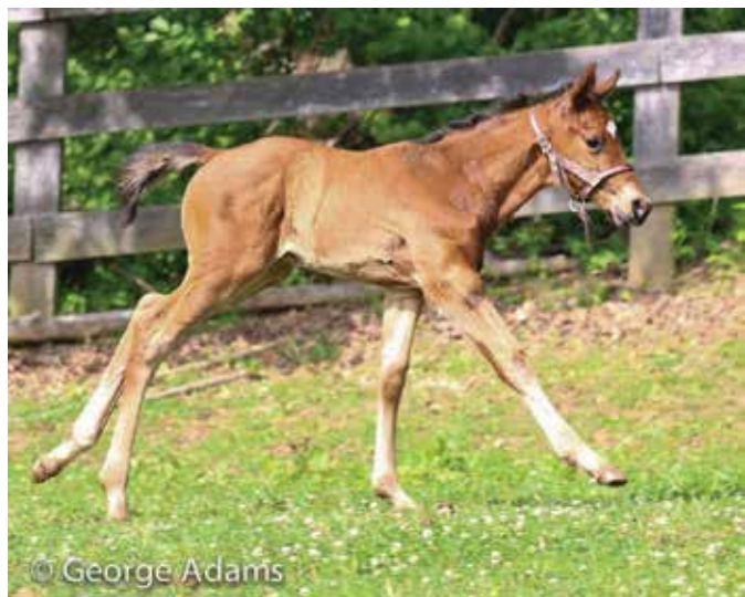
The Discreet Cat colt out of the Curlin mare Curlin's Needle, bred by Housatonic Stables LLC, is a mid-May foal.