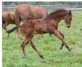
Friesan Fire colt out of Medaglia d'Oro mare In Dad's Wallet was foaled at Country Life Farm.