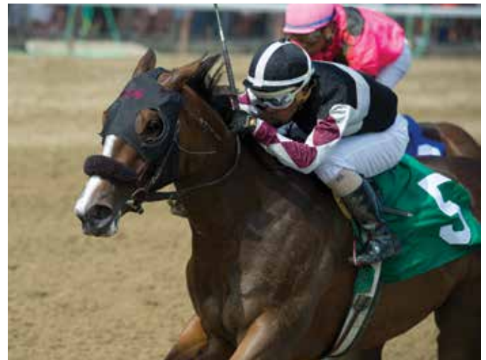
Two-year-old Southampton Way broke her maiden on opening day at Saratoga and placed in the Adirondack Stakes next out.

Two-year-old Southampton Way placed second in the Adirondack Stakes-G2 Aug. 12. The Maryland-bred filly, a daughter of Into Mischief and the Not For Love mare Roadtohana and the 2016 Maryland Horse Breeders Association yearling show grand champion, started the Sagamore success with a maiden win on Saratoga's Opening Day. The farm, owned by Under Armour CEO Kevin Plank, also picked up victories with Happy Farm in a $55,000