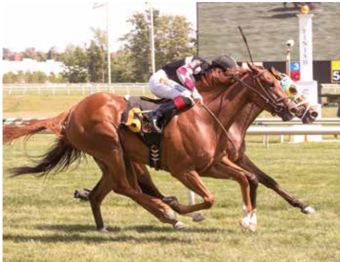
I'm Betty G (inside) and Riley's Choice were nearly inseparable down the stretch in an exciting renewal of the Pearl Necklace.